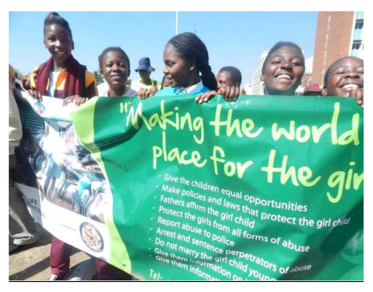
Figure 1: Young Girls Holding the TaLI Banner during a march to end child marriages in Zimbabwe, July 2015